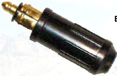
BMWPlug—BMW Type Plug