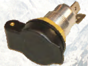
BMWSocketwCover—BMW Socket with Cover This socket comes with a spring loaded cover to keep out dirt and water.