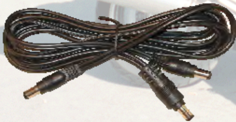
Y Cable Long—Y-CBL-LONG Y Cable for running Gloves without our liner or Socks 1 Length is 53 inch and 1 Length is 45 inch