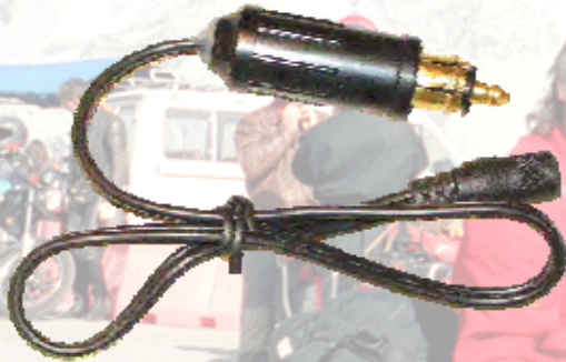
BMWPACC—BMW Plug to Coax Jack 18" Adapter This BMW style plug has 18" of 18 AWG wire to a Coax Jack. The BMW Plug is filled to keep the wires from coming out and to make it waterproof.