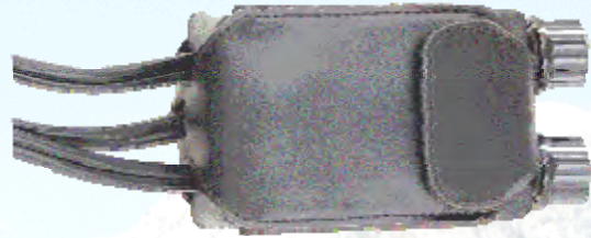
PouchDual—Dual Portable Heat-troller Pouch Convenient belt clip on back of pouch for clipping the Heat-troller to a belt or tank bag.